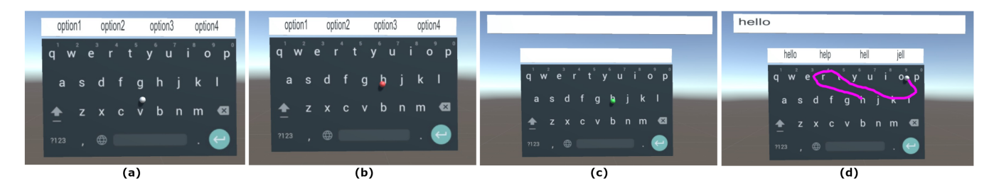
Figure 4: Shapeshifter looks and feels like the default Google Android keyboard. To enter text with Shapeshifter, the user (a) touches a surface (grey cursor), (b) applies extra force to activate the cursor (red cursor), (c) positions the cursor over the first letter of the intended word and applies extra force to start a gesture (green cursor), and (d) completes the gesture maintaining extra force, then reduces force to automatically enter the word associated with the gesture (pick tracing). Shapeshifter enables users to enter multiple words by switching between regular and extra force, without ever lifting the finger. Lifting the finger off the surface deactivates the cursor. The keyboard displays a suggestion bar with the most probable alternative words. The user can replace the output word with a suggested word by applying extra force upon moving the cursor over the suggested word, like pressing a button.

respectively. Touching a surface with the thimble displays the inactive cursor at the center of a virtual keyboard (Fig. 4). To activate the cursor, users increase and decrease contact force once as if they are pressing down and releasing an invisible button. Once activated, moving the finger moves the cursor over the keyboard. To switch to the gesturing mode, users apply and maintain extra force, then gesture type by connecting the letters in the sequence in which they appear in the intended word. Releasing extra force completes a gesture and enters the most probable word associated with the gesture. Expert users, therefore, can enter multiple words by switching between regular and extra force, without ever lifting their fingers. The keyboard provides visual feedback on gesture typing by tracing finger movements in pink. Moving the finger without applying extra force moves the cursor but does not select the items underneath. Users can also enter one character at a time, like entering text with a conventional keyboard, by increasing and deceasing contact force once like pressing a button. This feature is particularly useful when entering out-of-vocabulary (OOV) words.