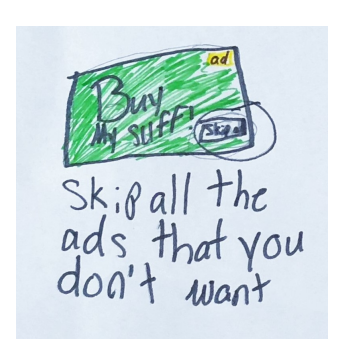
Figure 5: Children wanted better controls for the types of ads they see on social media.

on, and the content creators they follow on social media (Figure 2). Children also expressed interest in producing multimedia content, particularly images and videos. They criticized the current image and video production capabilities of popular social media platforms, thus wanted these to be simpler and more efficient. They also desired the ability to edit pictures and videos, and annotate with texts, shapes, images, and emojis (Figure 3). They felt that providing easy-to-follow instructions on how to capture images and videos, how to edit and annotate, and how to upload and stream multimedia could enhance the quality and quantity of the content created by child users. In keeping with the current trends, some children wanted an easy mechanism for converting pictures and videos to animations (GIFs) and memes. They also wanted to keep updated on how well their content is doing in terms of likes, shares, and comments, preferably via notifications.