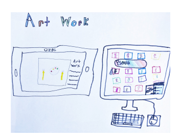
Figure 6: Children expressed interest in social media features that can foster their creativity.

We thank the Merced County Office of Education and Lorena Falasco Elementary School for their help and support.