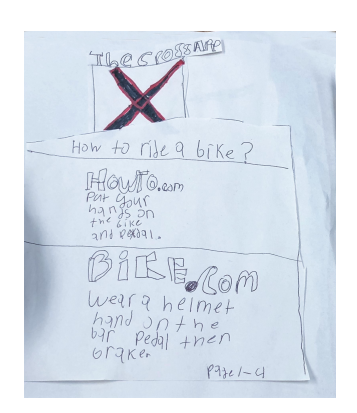
Figure 4: A design expressing the desire for easy-to-follow tutorials on social media to acquire new skills.