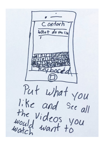
Figure 2: A design expressing the desire for better, personalized recommender systems for video suggestion.